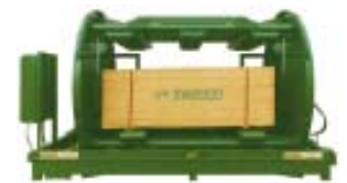
Pass Thru Turner

Within the conveyor line, each panel can be uniformly or selectively turned for grading purposes. Sweed Panel Turners feature nonabrasive arms that gently overturn the panels without damaging delicate veneer or laminate.