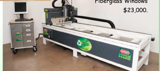
Special CNC for Fiberglass Windows $23,000.