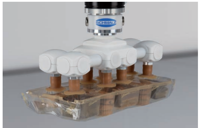
Vacuum end effector with flat suction pads SGPN for firm foil packaging