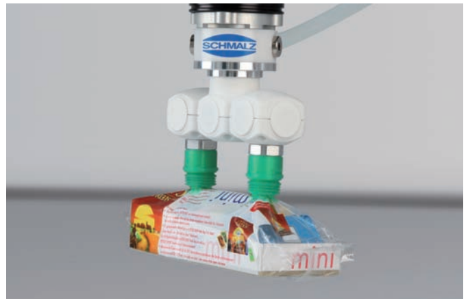
Vacuum end effector with bellows suction pads SPB4 for flow-wrapped packaging