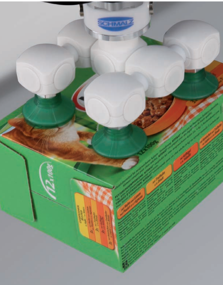
Vacuum end effector with bellows suction pads SPB1 for cardboard packaging