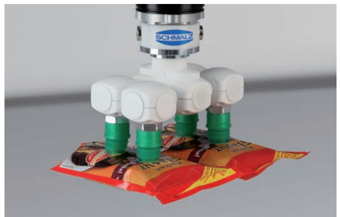
Vacuum end effector with bellows suction pads SPB4 for stand-up bags